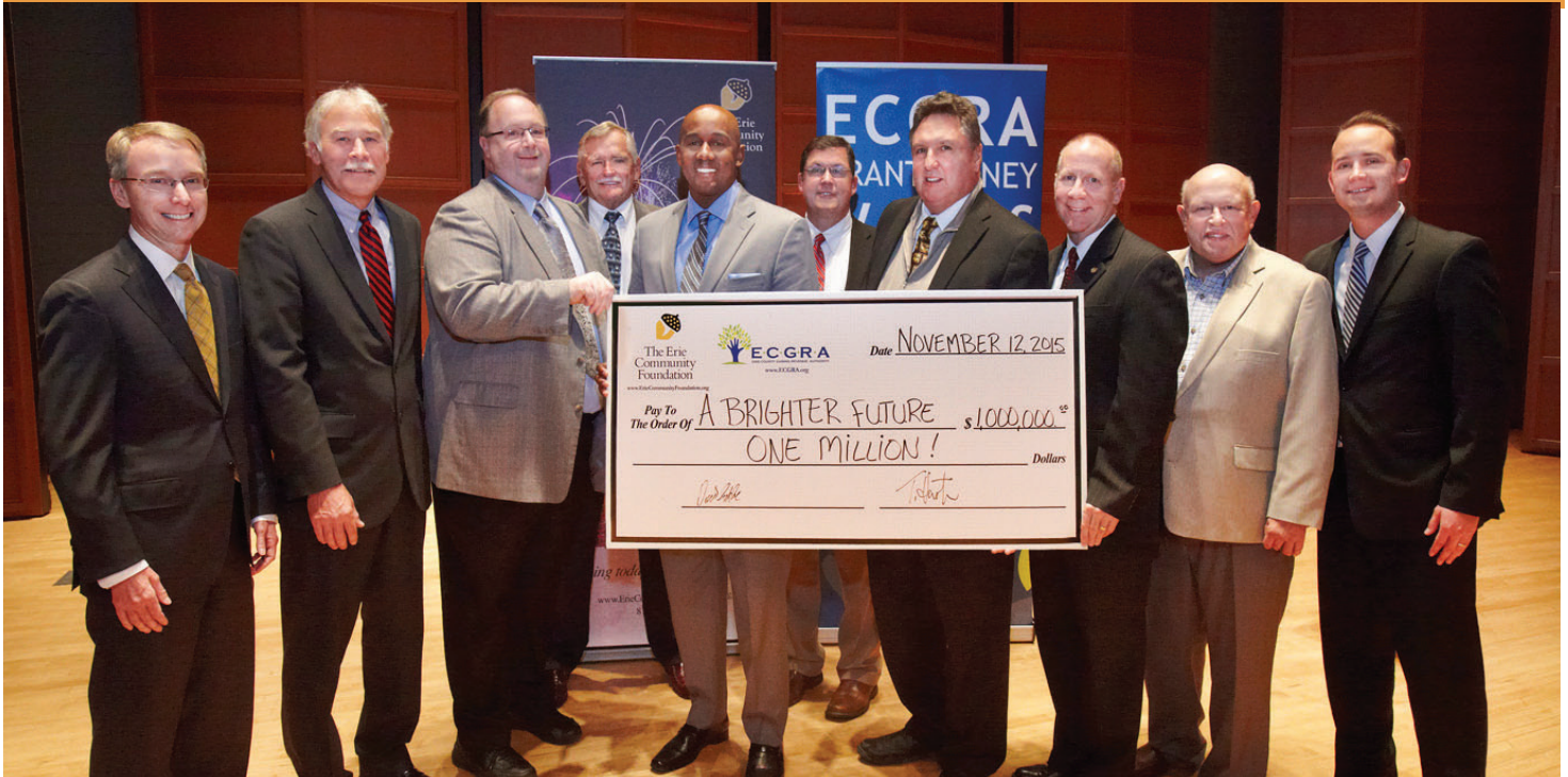
ECGRA and The Erie Community Foundation celebrate a $1 million collaboration for youth and education.