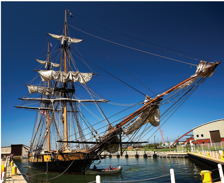
U.S. Brig Niagara in her home port.

For the 72-passenger Food + Fun bus used to feed and provide enrichment for children in Erie's food deserts $10,000