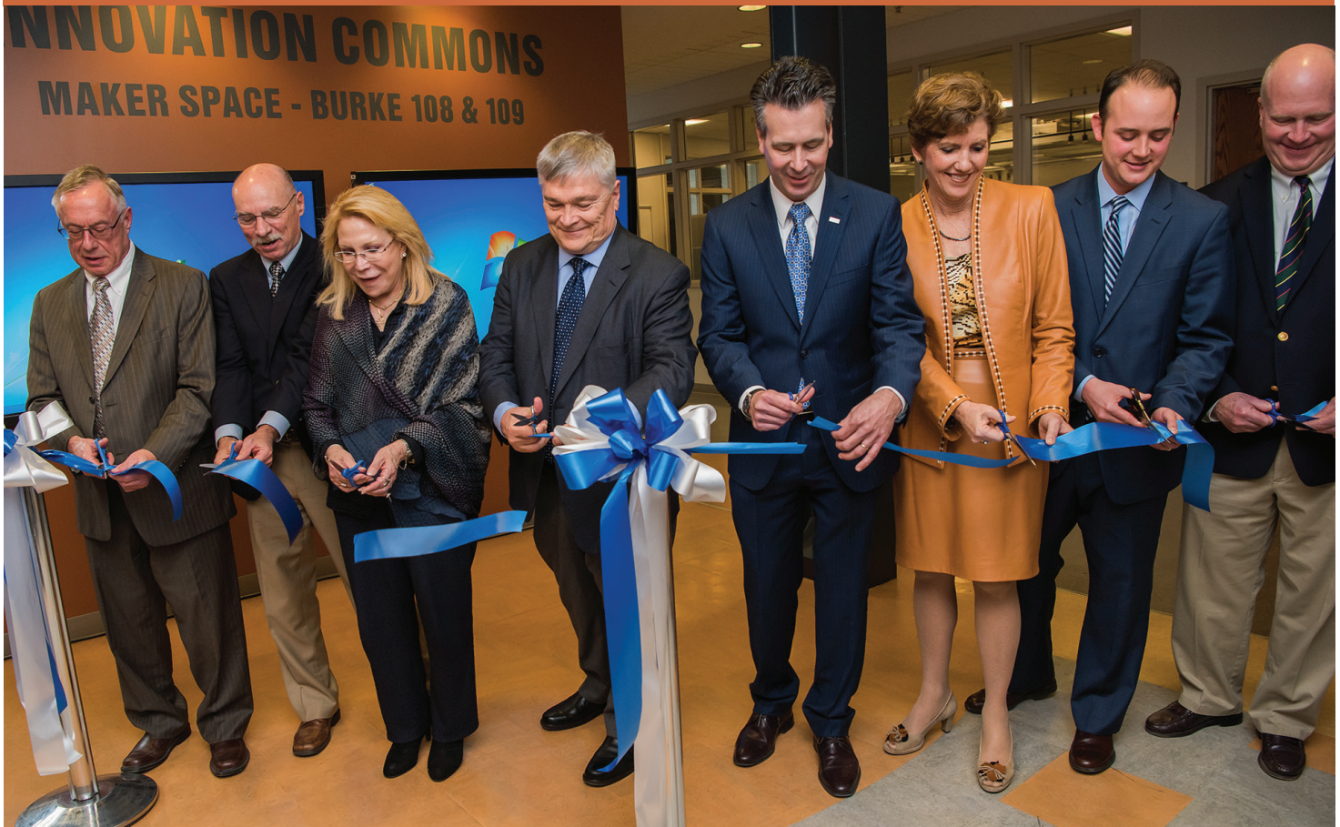
Penn State officials, community leaders, and Ignite Erie partners dedicate Innovation Commons.

To catalyze our region's private sector and develop Erie's entrepreneurial ecosystem by spurring small business development, building collaborations for business acceleration, and offering a broader spectrum of financing products for starting, growing, and reinventing small business. ECGRA has been making small business investments since 2011 and in 2013, launched Ignite Erie™, a $6 million multi-faceted collaborative for business growth.