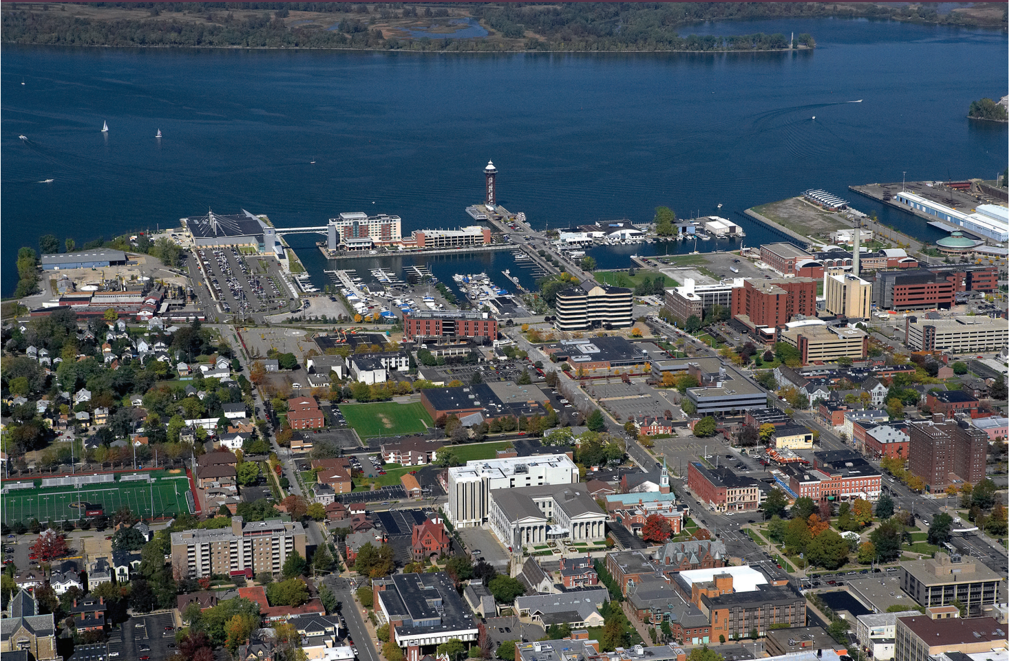
Aerial of the city of Erie and waterfront by Mark Fainstein Photography.

To foster progress and functional cooperation among Erie County's 38 municipal governments.