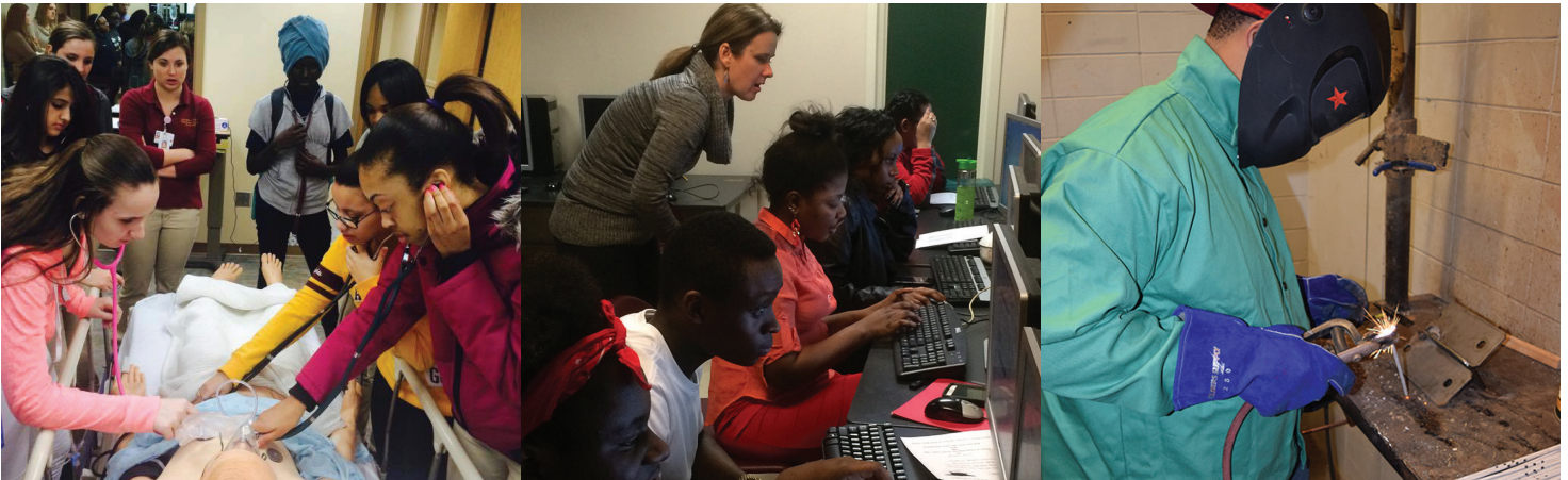
GO College and Tech After Hours