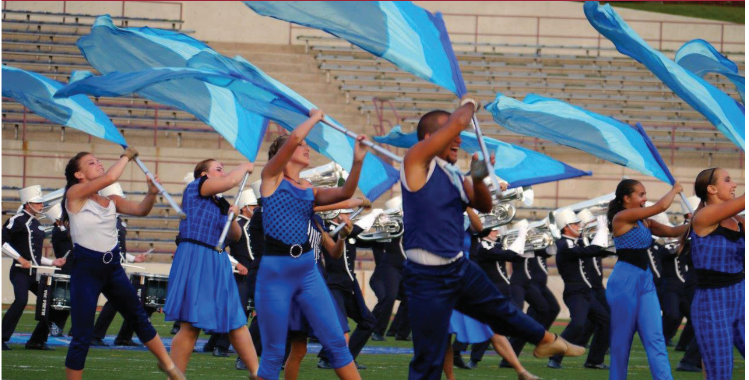
Lake Erie Fanfare, Inc. Annual Drum & Bugle Corps Competition

To promote well-being, foster civic pride, drive tourism, and attract, retain, and mobilize creative talent and innovative businesses through cultural, heritage, service, and recreational organizations and projects.